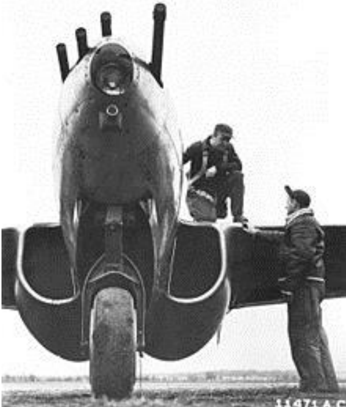
Details of fuselage and undercarriage of a P-59B, showing the nose armament

Major General Henry H. "Hap" Arnold became aware of the UK's jet program when he attended a taxiing demonstration of the Gloster E.28/39 in April 1941. The subject had been mentioned, but not in-depth, as part of the Tizard Mission the previous year. He requested and was given, the plans for the aircraft's powerplant, the Power Jets W.1 , which he took back to the U.S. He also arranged for an example of the engine, the Whittle W.1X turbojet, to be flown to the U.S. on 1 October in a Consolidated B-24 Liberator , [1] along with drawings for the more powerful W.2B/23 engine and a small team of Power Jets engineers. On 4 September, he offered the U.S. company General Electric a contract to produce an American version of the engine, which subsequently became the General Electric I-A . On the following day, he approached Lawrence Dale Bell , head of Bell Aircraft Corporation, to build a fighter to utilize it. Bell agreed and set to work on producing three prototypes. As a disinformation tactic, the USAAF gave the project the designation P-59A, to suggest it was a development of the unrelated Bell XP-59 fighter project which had been canceled. The design was finalized on 9 January 1942, and construction began. In March, long before the prototypes were completed, an order for 13 YP-59A pre-production aircraft was added to the contract. [2]