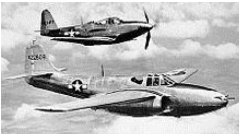
The first production P-59A with a Bell P-63 Kingcobra behind