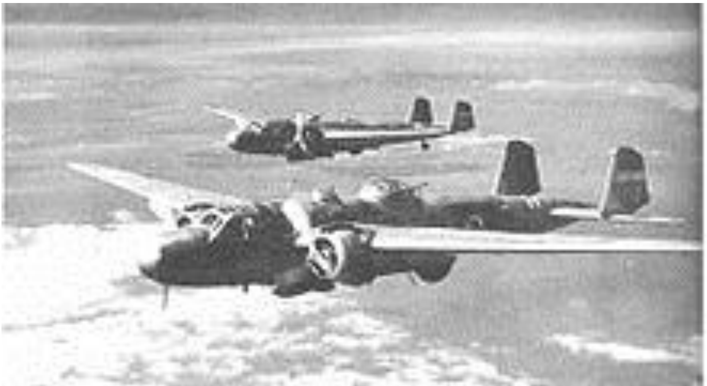
Two G3M2 bombers - the nearest Model 22 and the other a Model 21

The G3M has its origins in a specification submitted to the Mitsubishi company from the Imperial Japanese Navy requesting a bomber aircraft with a range unprecedented [ citation needed ] at the time. This principally stemmed from Admiral Isoroku Yamamoto 's influence in the Naval High Commission. The bomber was to have the capacity to accommodate an aerial torpedo capable of sinking an armoured battleship . The speed requirement submitted by the naval department was again also unprecedented [ citation needed ] , not only in Japanese but also in international bomber aviation, where in relation to the envisaged Japanese battlegrounds of China and the Pacific, the bomber would need to not only cover long distances, but necessarily have exceptional speed to strike distant targets with a minimum attack time. Thus the G3M was an embodiment of Japanese military aircraft design in the brief period leading to the Pacific War , with powerful offensive armament (in this case in the form of bombs and torpedoes) and range and speed emphasised over protection and defensive capabilities.