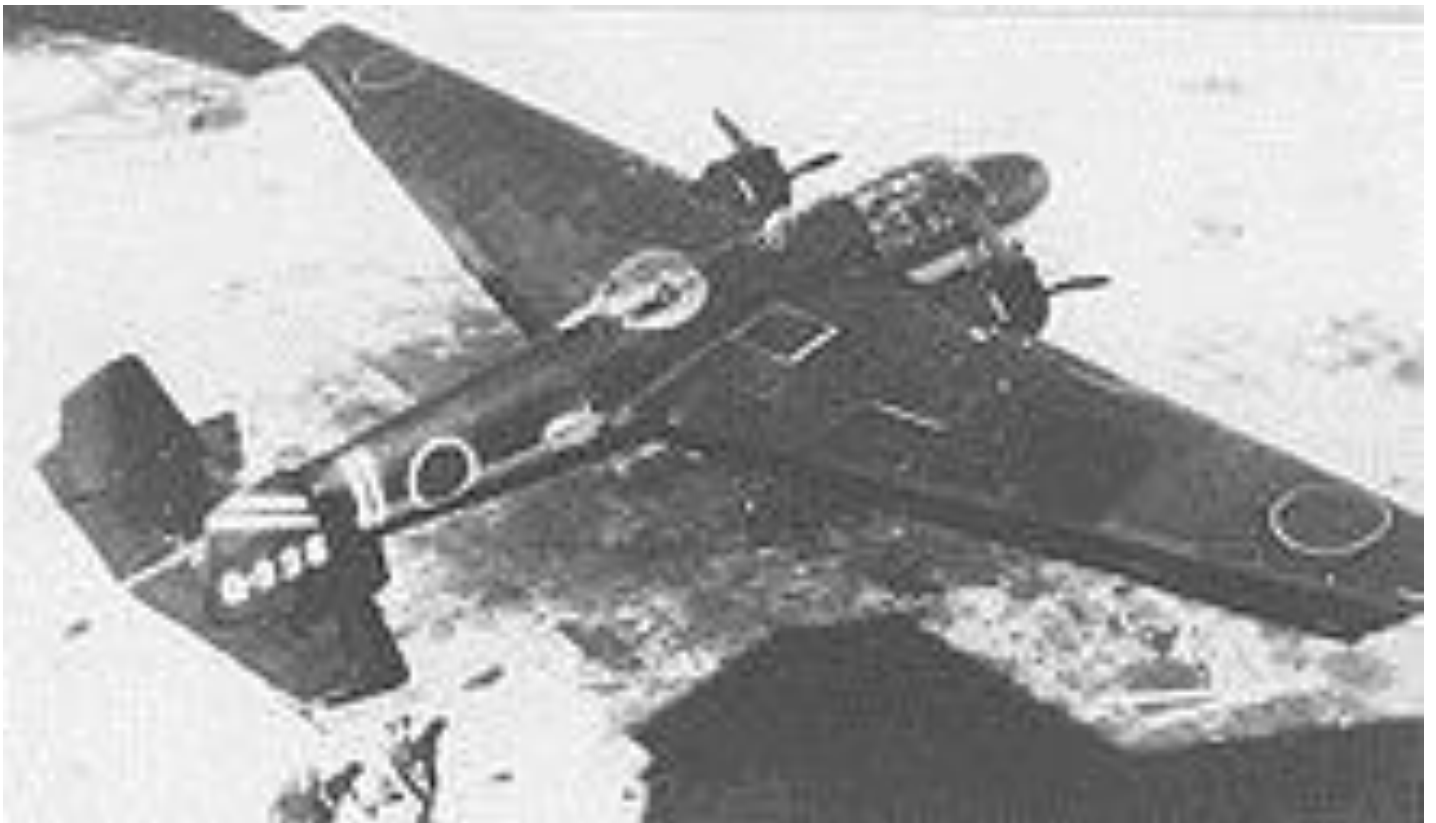
A G3M from the Genzan Kōkūtai as can be seen from the code on the tail.

The attacking G3M bombers and escorting fighters were often engaged by Curtiss Hawk III and Boeing P-26/281 fighters of the Chinese Air Force early on in the war. Later, from bases in occupied Chinese territories, it took part in the strategic carpet bombing of the Chinese heartland, its combat range being sufficient for the great distances involved. Most notably, it was involved in the round-the-clock bombing of Chongqing . When the Pacific War erupted with the invasion of Malaya and bombing of Pearl Harbor in December 1941, the G3M was by this time considered to be antiquated, but still three front-line units (the 22nd to 24th koku sentai ) were operating a total of 204 G3M2s in four kōkūtai (naval air corps) in the central Pacific [5] and of these 54 aircraft from the Takao Kōkūtai [6][7] were deployed from Formosa in the opening of the Battle of the Philippines . On 8 December 1941, (7 December across the International Date Line ), G3Ms from the Mihoro Kōkūtai struck Singapore from bases in occupied Vietnam as one of many air raids during the Battle of Singapore , resulting in thousands of British and Asian civilians dead. Wake Island was similarly bombed by G3Ms from the Chitose Kōkūtai on the first day of the war, with both civilian and US Navy infrastructure being heavily damaged on the ground. Other G3Ms of Chitose Kōkūtai , based in Kwajalein Atoll , attacked US Navy and civilian installations on Howland Island in the same period.