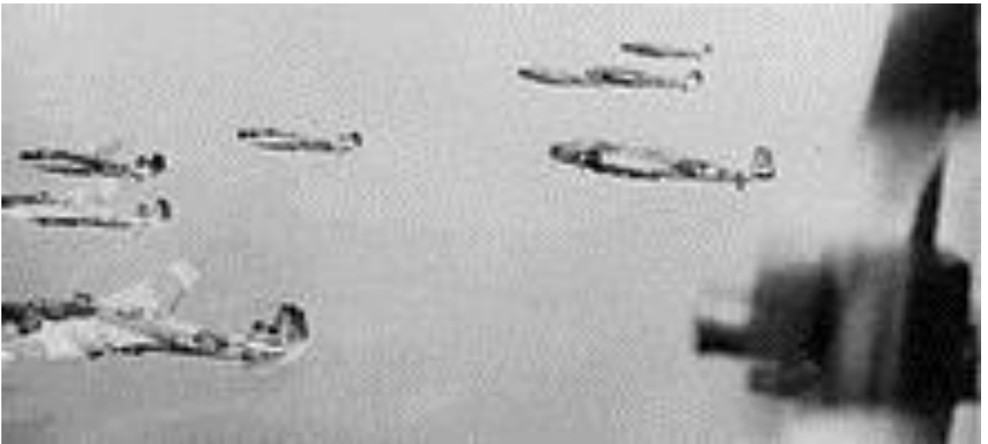
A formation of G3Ms

The G3M flew for first time in 1935, taking off from a Nagasaki airfield belonging to Mitsubishi Heavy Industries and landing at Haneda Airport on the outskirts of Tokyo . The G3M first saw combat in Japan's expansionist campaigns on the Chinese mainland in what became known as the " Second Sino-Japanese War ", where the G3M was able to exploit its long-range capability when, during August–November 1937, the 1. Rengo Kōkūtai (a special unit) was established, operating alongside the Kanoya and Kizarazu Kōkūtai based in Taipei , Formosa , Omura , Kyūshū and Jeju Island . On 14 August of that same year, 42 G3Ms and seven Hiro G2H1s , escorted by 12 Nakajima A4Ns and 12 Mitsubishi A5Ms of the 2. Rengo Kōkūtai (a unit consisting of the 12th and 13th kōkūtai ), departed from their bases to cross the East China Sea for the bombing of Hangchow and Kwanteh , and performed, amongst other actions, terror bombing of coastal and inland targets in China, including bombing during the Battle of Shanghai and Nanjing .