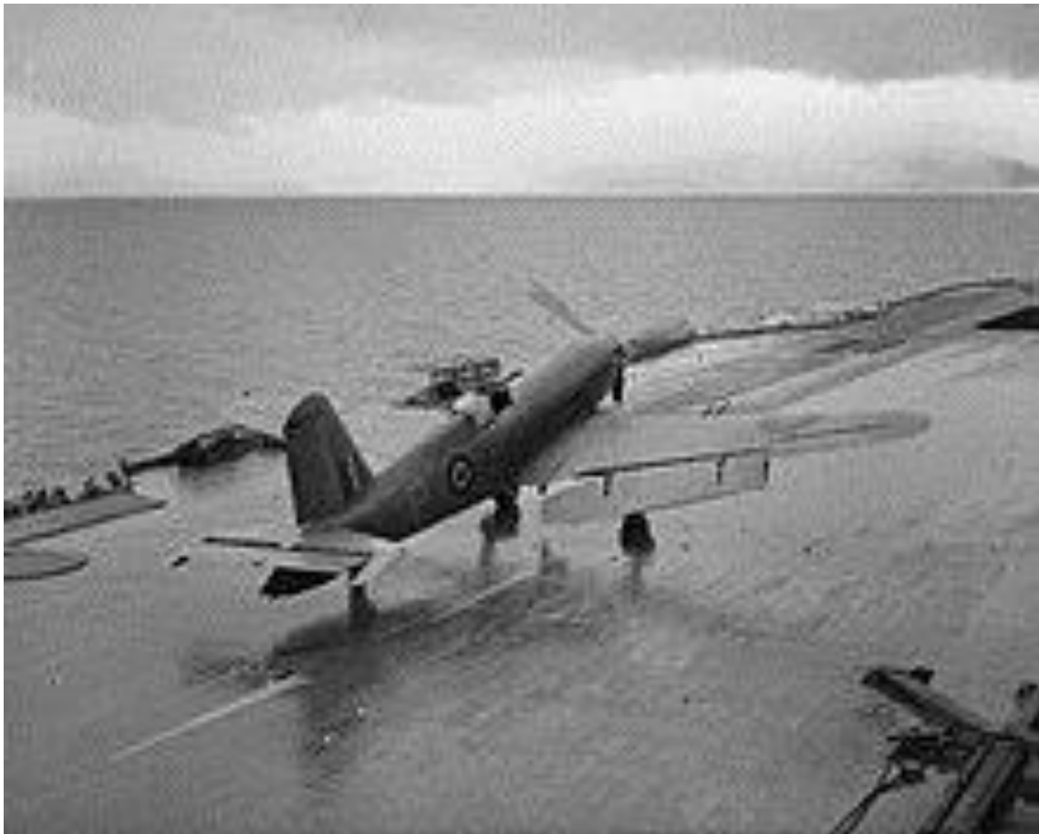
A prototype Firebrand TF Mk II taxiing along the flight deck of HMS Illustrious with its flaps extended during trials